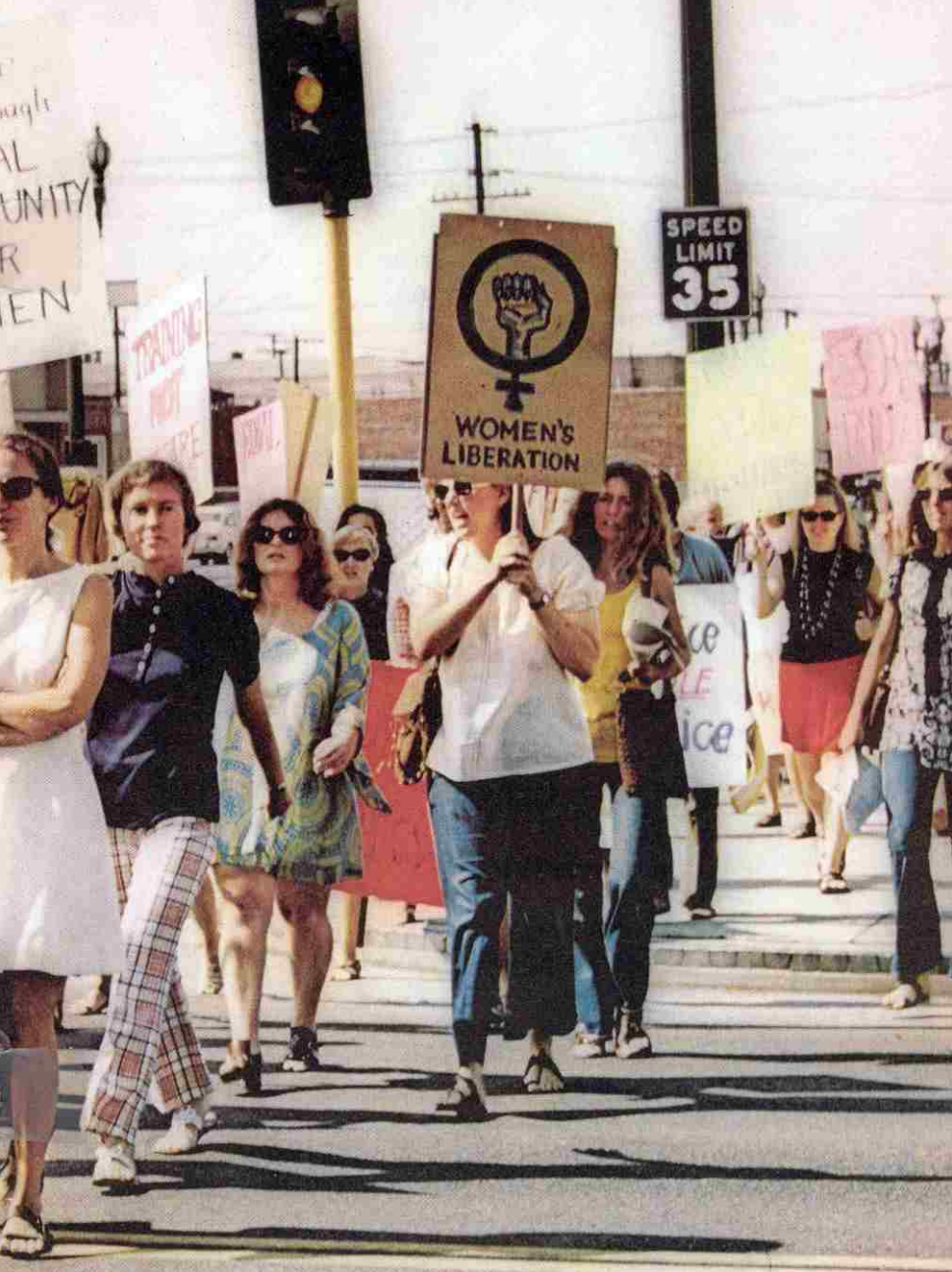
"WOMEN ON THE MARCH" — Placards show grievances of women, as they parade during "show of force."